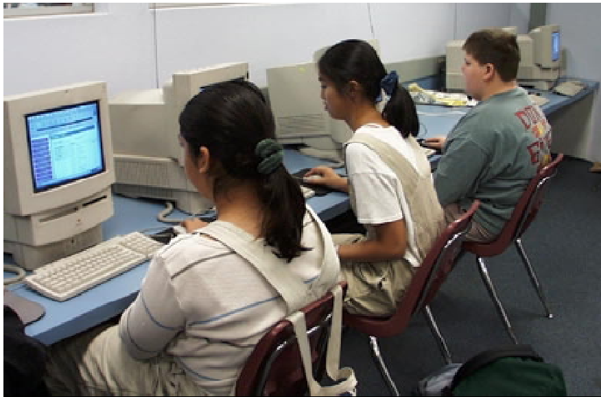
Technology at Huntington Middle School is used to enhance communications, information processing, and problem solving.